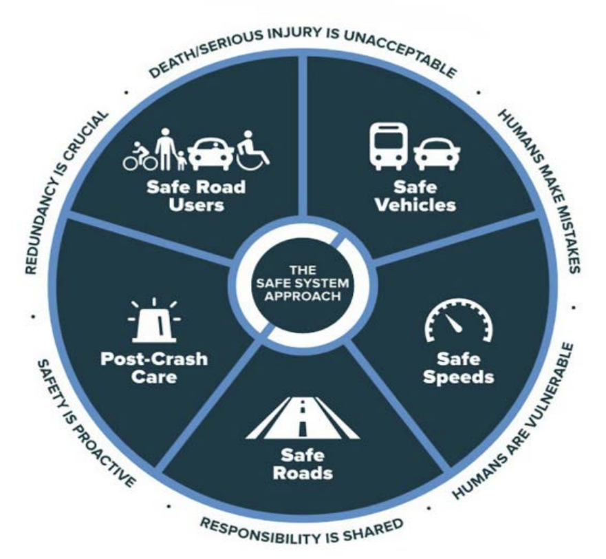
Chart 3. The Safe System Approach